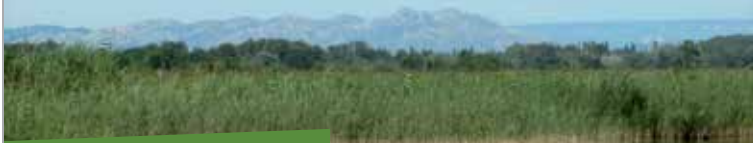
The Crau swamps