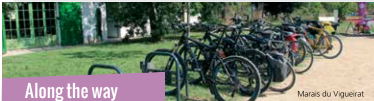
Marais du Vigueirat