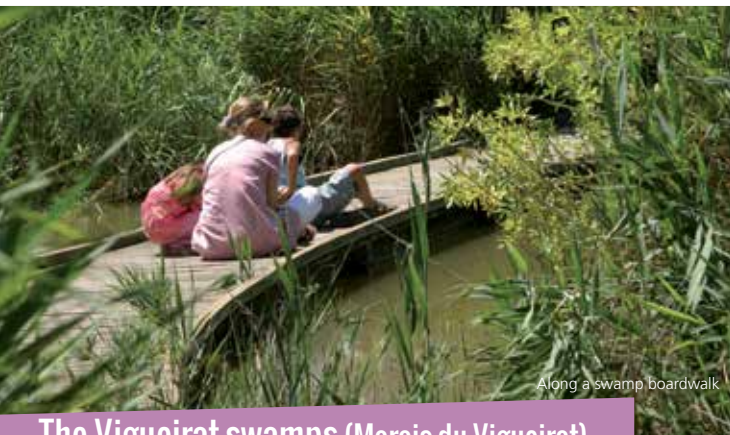
Along a swamp boardwalk

During this tour you will cross a pipe line, similar to gas or petroleum pipes, heading to or from the Fos-sur-Mer industrial and port zone. A "saumoduc" carries brine, in other words salt water. It is an industrial pipe line, carrying brine from the place where it is produced (salt marshes, caves or rock salt mines...) to factories for use in industrial products.